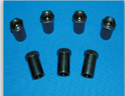
Posilock/Polylock Nuts With Set Screw